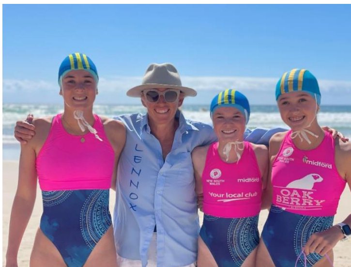
Surf Sports Coordinator with some of our Junior and Cadet Competitors