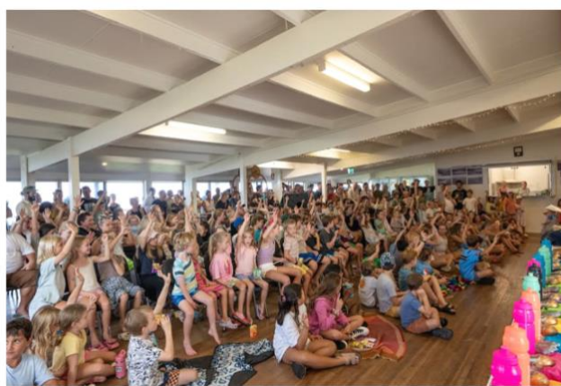
End of Season Nippers Presentation