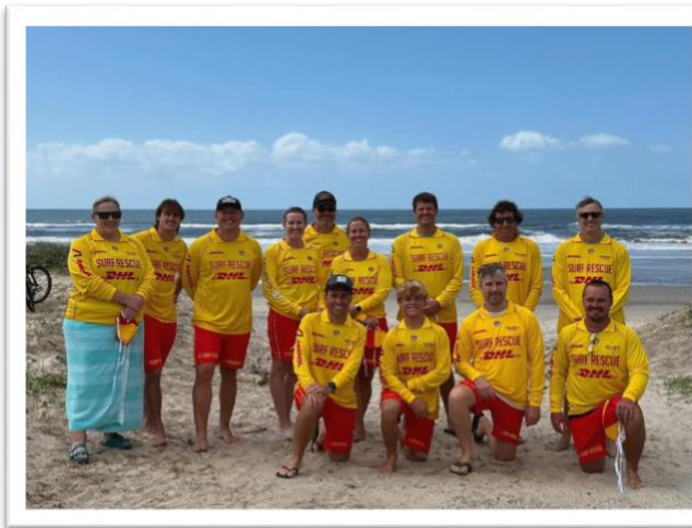
New Bronze Medallion Holders