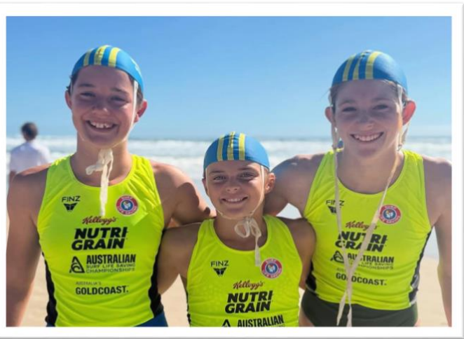
Aussie Titles Competitors

Thank you also to the LHASLSC Management Committee for the time that they contribute to the Club above and beyond, Patrols, Nippers, Training, Officiating and Water Safety.